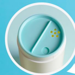
Twist Locking Sifter