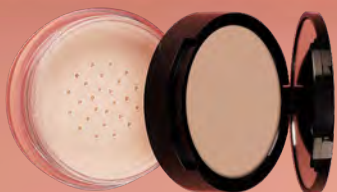
1. ICS-JAR220109 (CN) (52ml OFC) 68mmD x 38.5mmH Cap w/mirror (ABS outer/PP inner), PETG jar, PP sifter, PE liner