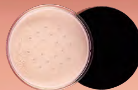
3. ICS-JAR190052 (CN) (44ml OFC) 65mmD x 25mmH ABS cap, PETG jar, PP sifter, PE liner