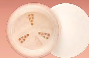
4. ICS-LOP100011 (TW) (30g OFC) 76mmD x 33mmH Mono-material PP w/twist sifter and 3 dividers