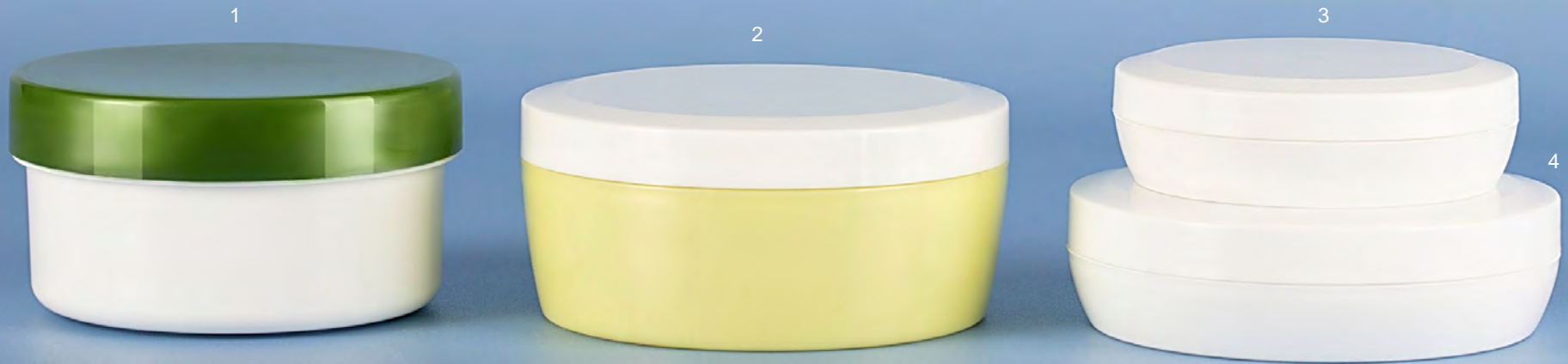
1. ICS-JAR130023 (CN) (150ml) 90mmD x 50mmH