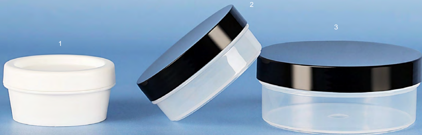
1. ICS-JAR190060 (CN) (60ml fill, 85ml OFC) 72mmD x 35mmH