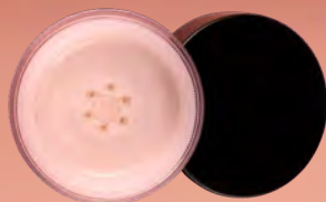
2. ICS-JAR240027 (CN) (15ml OFC) 57mmD x 28mmH PET cap & jar, PP twist sifter, PE liner